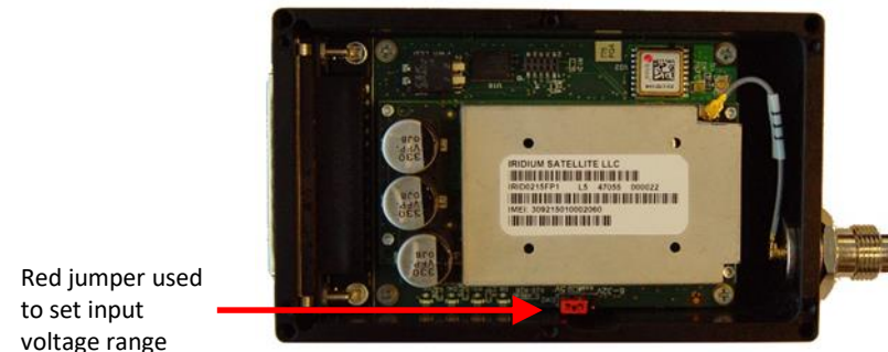
Red jumper used to set input voltage range